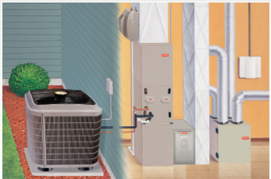
Heat Pump and Fan Coil System